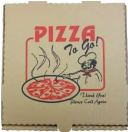
Brown / 2 colors