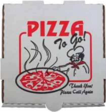
White / 2 colors