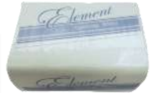
Quicknap - White